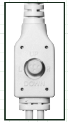
In-Line Cable Mounted OSD Control